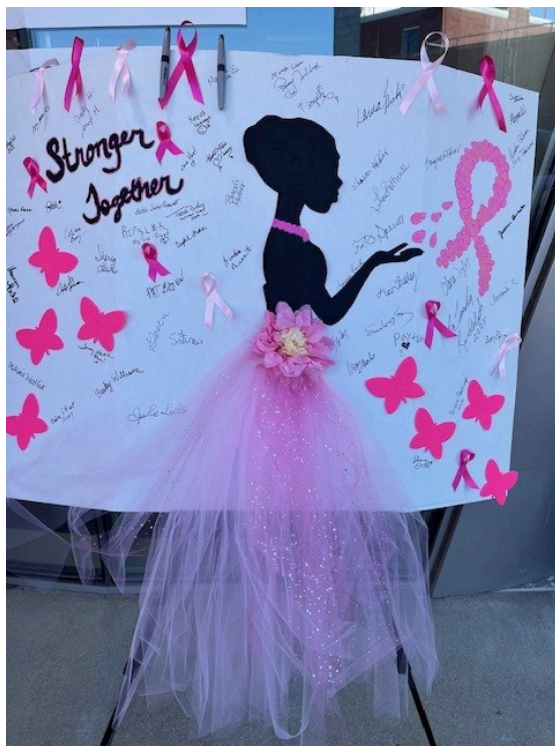
The Robley Rex VA Medical Center hosted its annual Women's Health Open House on September 27, welcoming more than 50 women Veterans from across the region. The